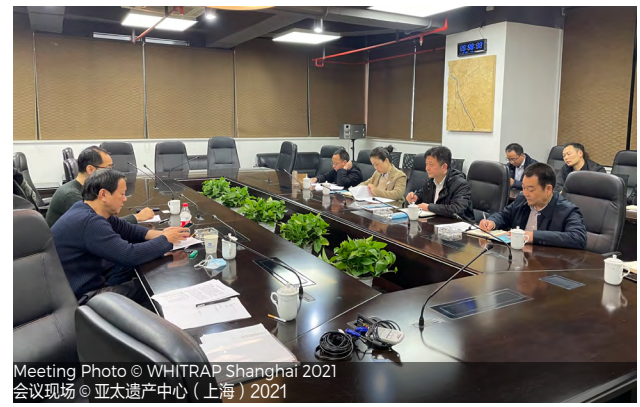
<sup>1</sup> SU Xun, SU Shi, SU Zhe, Song Dynast 三苏指:宋代苏洵、苏轼、苏辙

会上,孙剑副市长就眉山相关文化遗产的和"三苏文化"进 行了介绍,表示对双方未来的合作充满期待。周俭秘书长对代表团 一行来访表示热烈欢迎,并详细介绍了中心在遗产保护与培训领域 的丰富工作经验,副秘书长李昕就如何助力眉山文化遗产保护也提 出了建议。此次交流使双方看到各自发展的机遇,通过交流探讨, 亚太遗产中心上海中心未来将务实推进,为未来的相关合作提供专 业、高效的指导和建议。