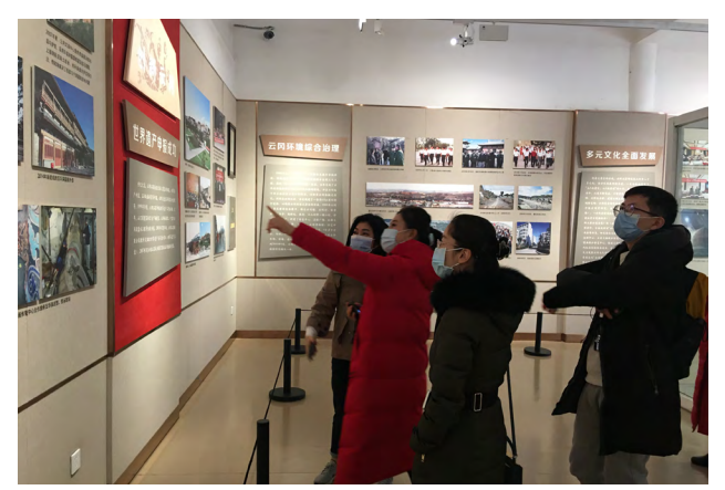
Visiting Local Museum 参观展览

上海中心由项目主管穆星宇代表中心出席此次会议,天立集团 由天立立行研学总经理陶毅先生作为代表出席,双方以四川的世界 遗产为基础,讨论现阶段基础教育中对世界遗产的关注以及世界遗 产在基础教育方面的价值、可执行方向等等问题,并在基础教育中 需加强世界遗产教育方面达成共识。