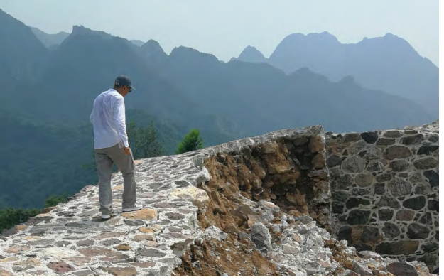
Field Trip in Creat Wall © Architecture Conservation Laboratory 2019 / Bejing 长城石灰结构考察 © 同济大学历史建筑保护实验中心 2019 / 北京

亚太遗产中心苏州中心自2009年连续开展"亚太地区古建筑 保护与修复技术高级人才培训班",积累了大量世界遗产古建筑 保护与修复的理论、方法和技术案例。为此,苏州中心对历年培 训班课程内容进行了梳理,拟编制出版文化遗产保护修复系列读 本。2020年初,苏州中心与同济大学达成合作,启动"文化遗产 保护修复读本1期(石灰与文化遗产保护)"的编制工作。读本包 括实用理论与准则、石灰基本知识与历史、修复技术、实践案例四 个部分,针对石灰与文化遗产保护,征引国外领先技术、实验成果 与案例经验,结合国内修复案例开展相关研究,采用中英文对照和 彩色配图编制成册,拟于2021年下半年正式出版。