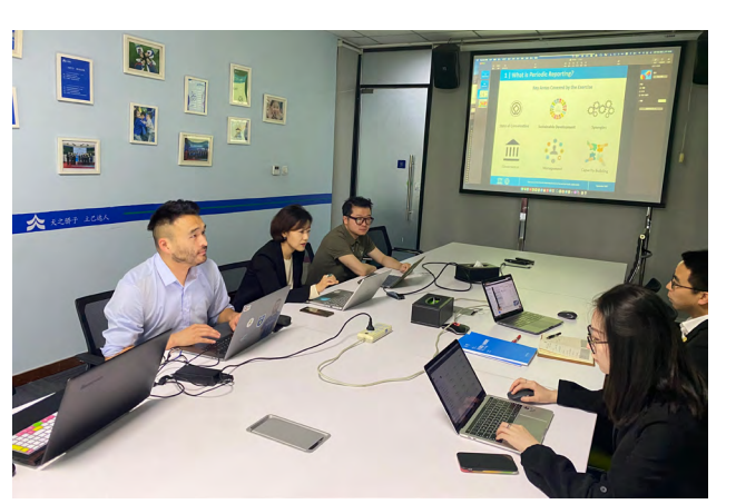
Meeting Photo 会议现场