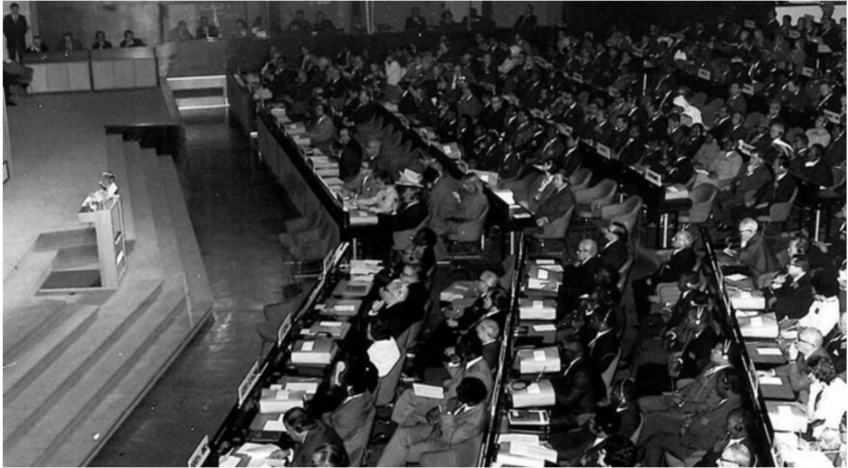
Adoption of the 1972 World Heritage Convention in Room 1, UNESCO, Paris France