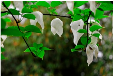
Primula fangingensis

Country: China Category of site: Natural site Date of inscription: 2018 Criteria: (x)