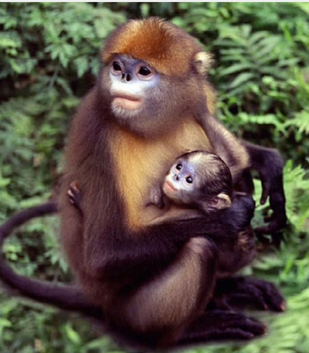
The sanctuaries and paradise for many animals