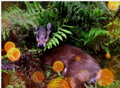
The sanctuaries and paradise for many animals