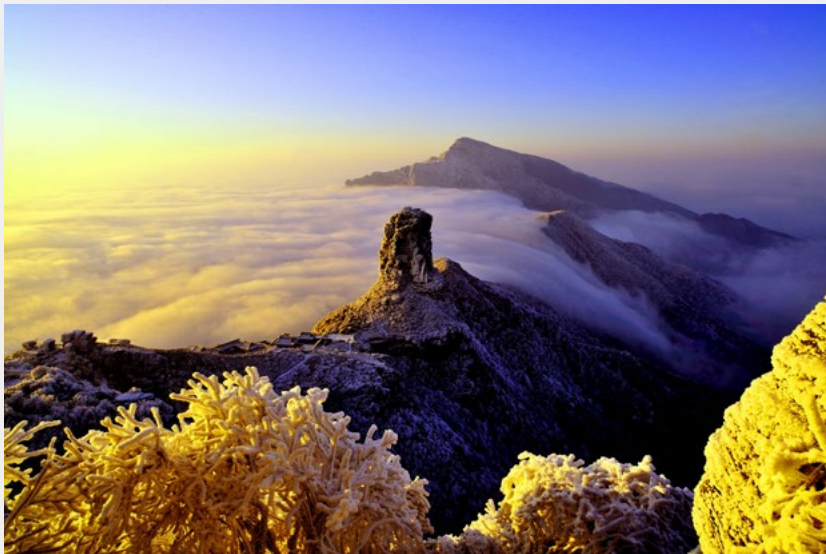
Waterfall-like clouds