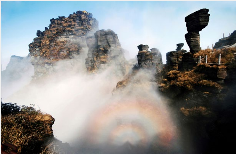
Buddha's light